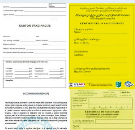
From upper left to lower right: National vaccination records of Bosnia and Herzegovina, Georgia, Montenegro, Republic of Moldova