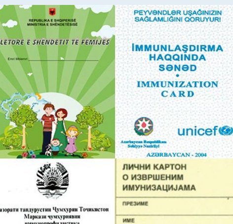
From upper left to lower right: National vaccination records of Albania, Azerbaijan, Tajikistan, Serbia