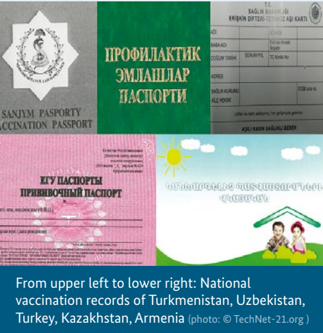
From upper left to lower right: National vaccination records of Turkmenistan, Uzbekistan, Turkey, Kazakhstan, Armenia

on the basis of a decision by the German Bundestag