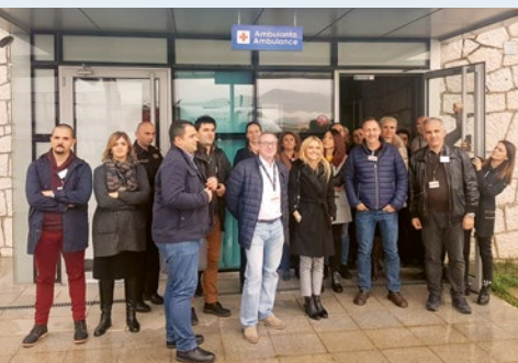
Montenegro: Workshop on PPE, disinfection and decontamination at Podgorica International Airport, November 2018