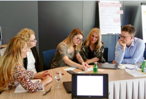
Montenegro: First transnational, regional GETPrepaReD workshop, June 2019

on the basis of a decision by the German Bundestag