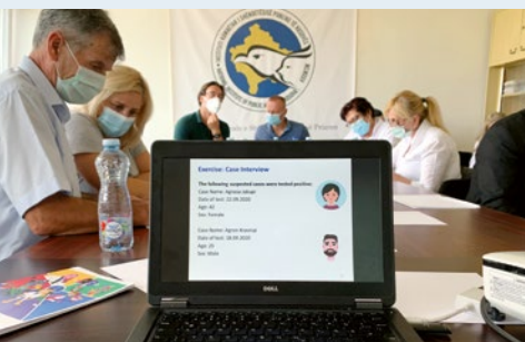
Kosovo: Training for COVID-19 contact tracing in Prizren, September 2020